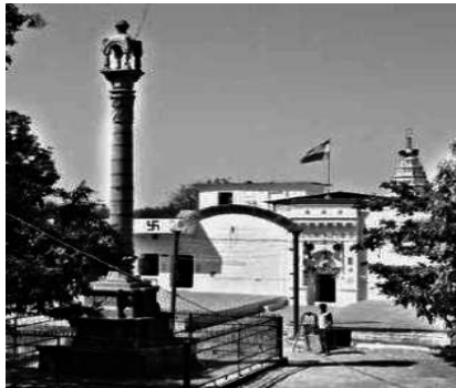
Renovated the Parshwanath Temple at Kamthana in Bidartaluk

Kamthana Jainism center, by Jain munis and shravaks choose this place to seek salvation through 'sallekhana'. Srivatsa (North Indian tradition), is a diamond-shaped mark on the chest of the Parshvanath 3 ParshvanathTirthankara idol is about 115-cm tall and 55-cm wide, in the paryankasanastyle, sheltered under a seven-hooded serpent, it was installed about 900 years back. A small lamp burns day and night in the cave. The light of the lamp is reflected in 1,000 mirrors plastered on to the wall.