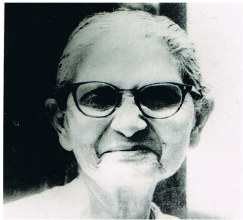
Chandrabhabha Saikiani A Legendary Voice of Courage and Social Transformation

Chandrabhabha Saikiani (16 March, 1901 - 16 March, 1972) stands as one of the most influential pioneers of women's awakening in modern Assam. Born in the early twentieth century in a conservative social environment, she displayed remarkable courage and intellectual determination from a young age, recognizing education as a powerful tool for social transformation. Throughout her life, she actively challenged restrictive customs imposed on women and advocated strongly for female education, dignity, and participation in public life. As a leading organizer of the Assam Pradeshik Mahila Samiti, she mobilized women across Assam to raise their voices against social inequality and gender discrimination. Her ideological vision was deeply connected with broader national reform movements and the struggle for social justice, which inspired many women to step beyond traditional domestic boundaries. Until her passing in 1972, Chandrabhabha Saikiani remained a symbol of intellectual courage, progressive thought, and social reform, leaving a lasting legacy in the historical development of women's empowerment and modern Assamese society.